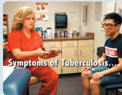
Symptoms of Tuberculosis...

These students are assisted through a process including questions asked to determine country of origin, past and present health concerns, immunizations, and exposure to tuberculosis. This determines who will need a Quantiferon Gold TB blood test . These tests require a blood draw